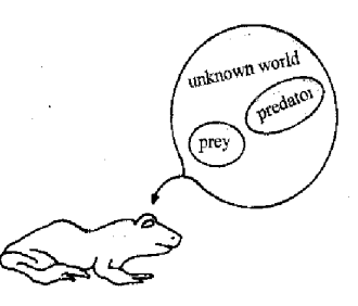
Figure 1. Frog's visual system classifying retinal images of external objects into what is known and unknown. The known object is further divided into what is biologically favorable (prey) and unfavorable (predator).

In 1957 Lettvin et al. [2] discovered two major populations of neurons called sameness neurons and newness neurons [3] in frog's visual system classifying retinal images of external objects into what is known and unknown. The newness neurons are excited to bring the animal into attentive state in search for unknown stimuli. The known objects are further divided by higher-level neurons into two